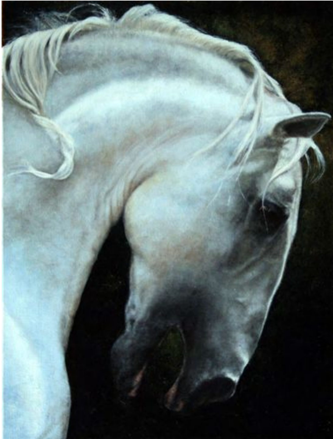
Leaving Eden: Blue oil and gold leaf on canvas 24" x 18"