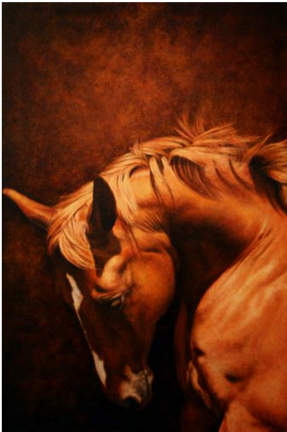
Leaving Eden: if wishes were horses oil and gold leaf on canvas 36" x 24"