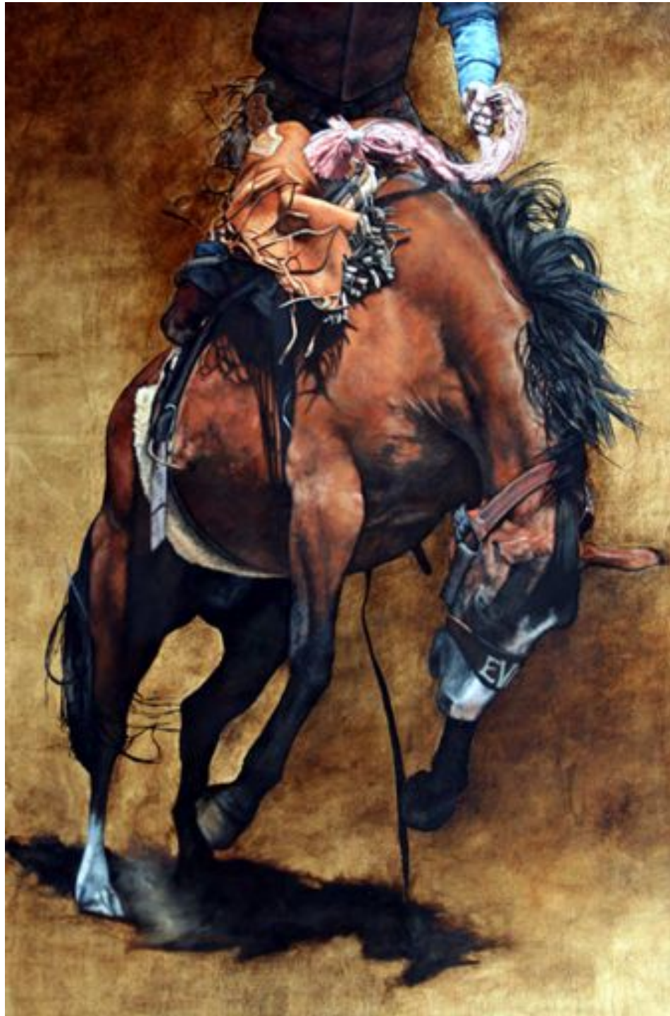
Leaving Eden: the horse I rode in on oil and gold leaf on canvas 60" x 40"