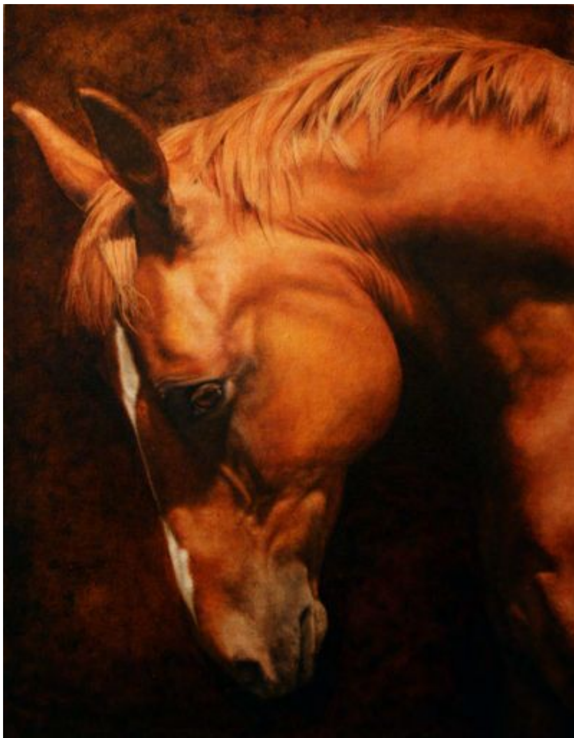
Leaving Eden: Pretender oil and gold leaf on canvas 28" x 22"