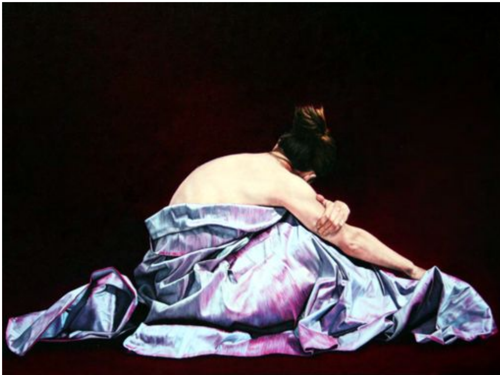
Contemplating Eve 5