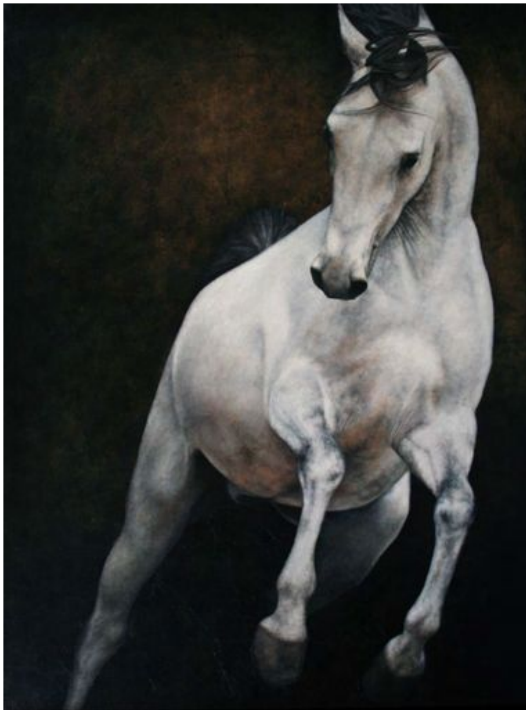
Leaving Eden: Leap oil and gold leaf on canvas 36" x 48"