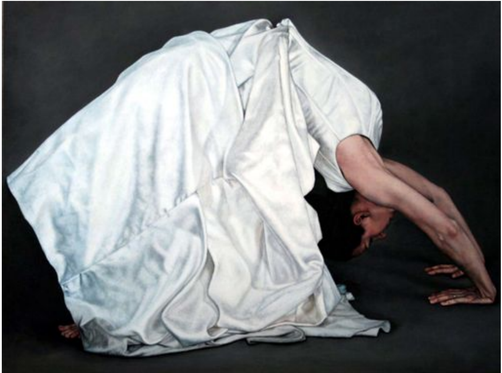
Adam's Rib oil on canvas 36" x 48"