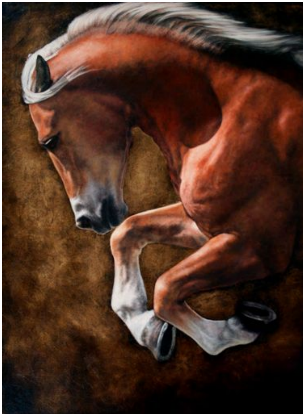
Leaving Eden: Exodus oil and gold leaf on canvas 48" x 36"