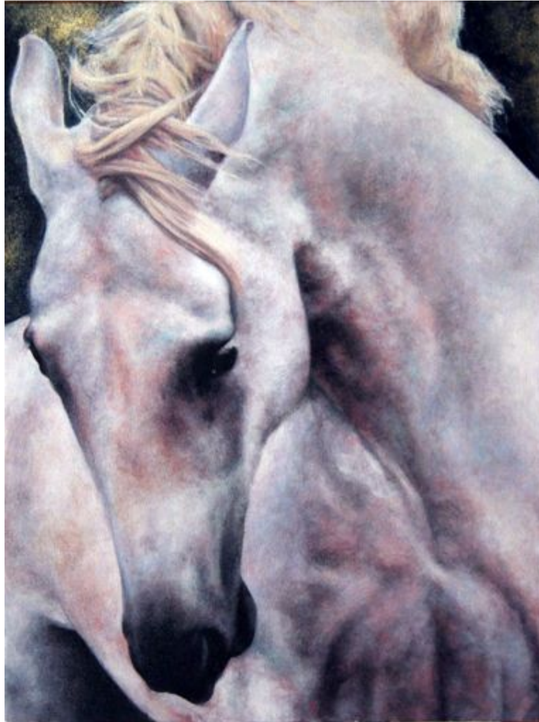
Leaving Eden: The Rainmaker