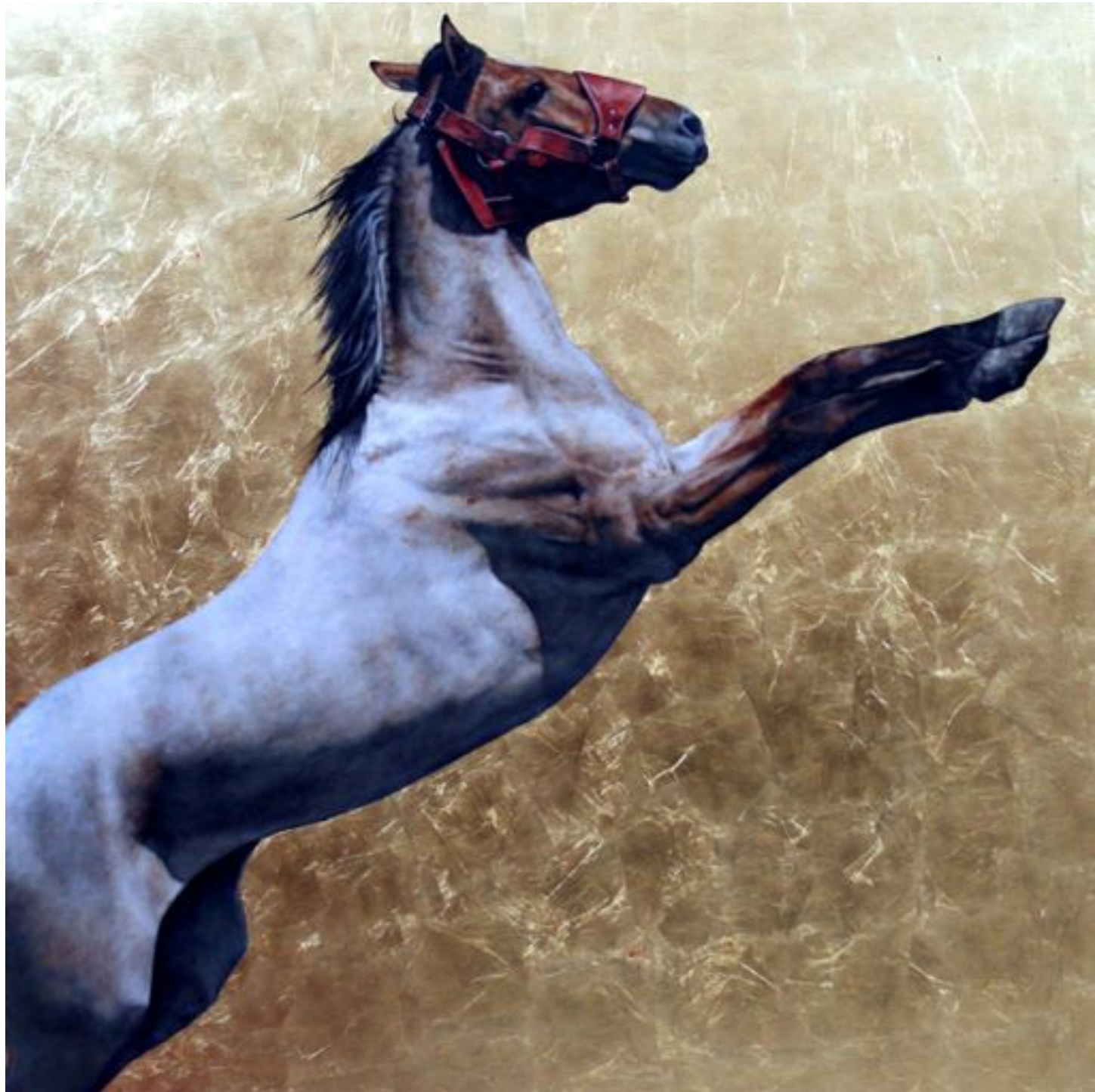
Leaving Eden: we don't ride them anymore oil and gold leaf on wood 48" x 48"