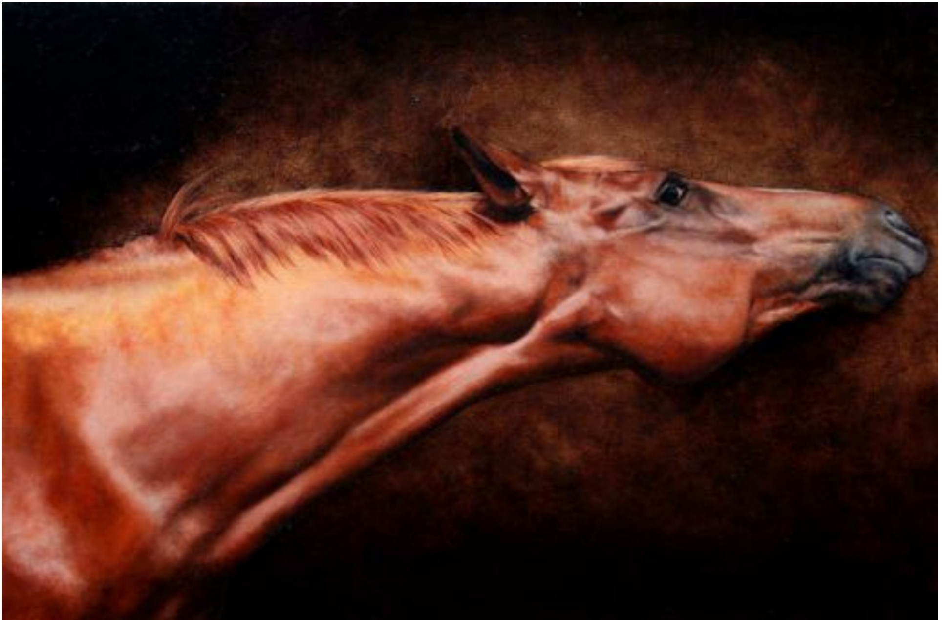
6 Leaving Eden: Golden oil and gold leaf on canvas 24" x 36"