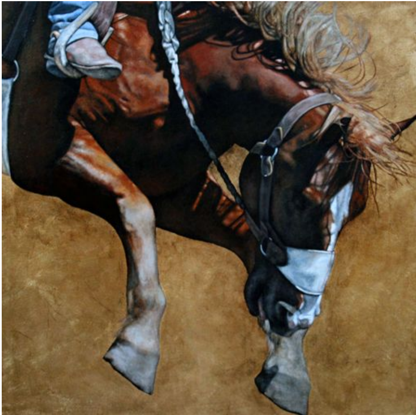
Leaving Eden oil and gold leaf on wood 36" x 36"