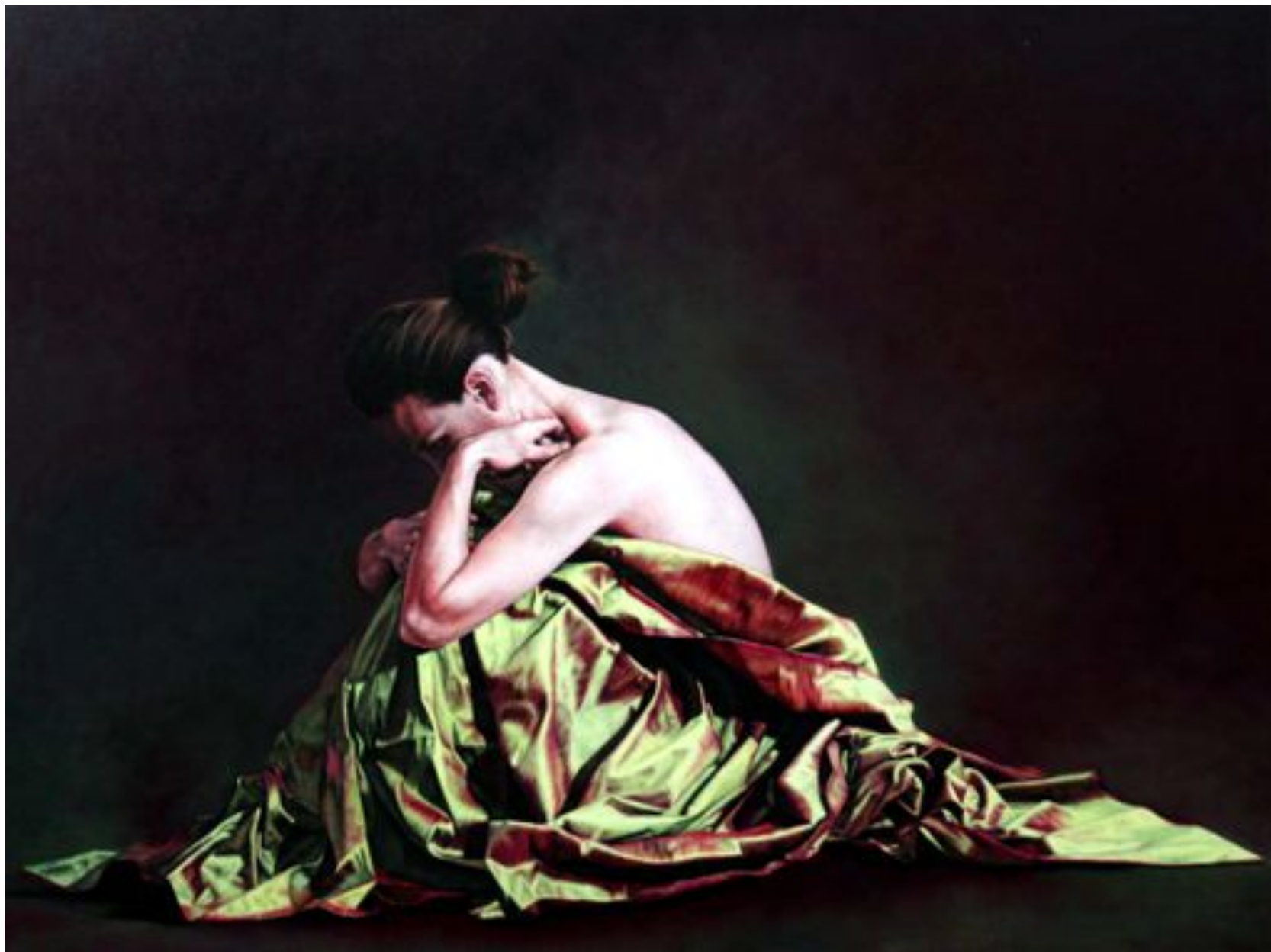
Contemplating Eve 4