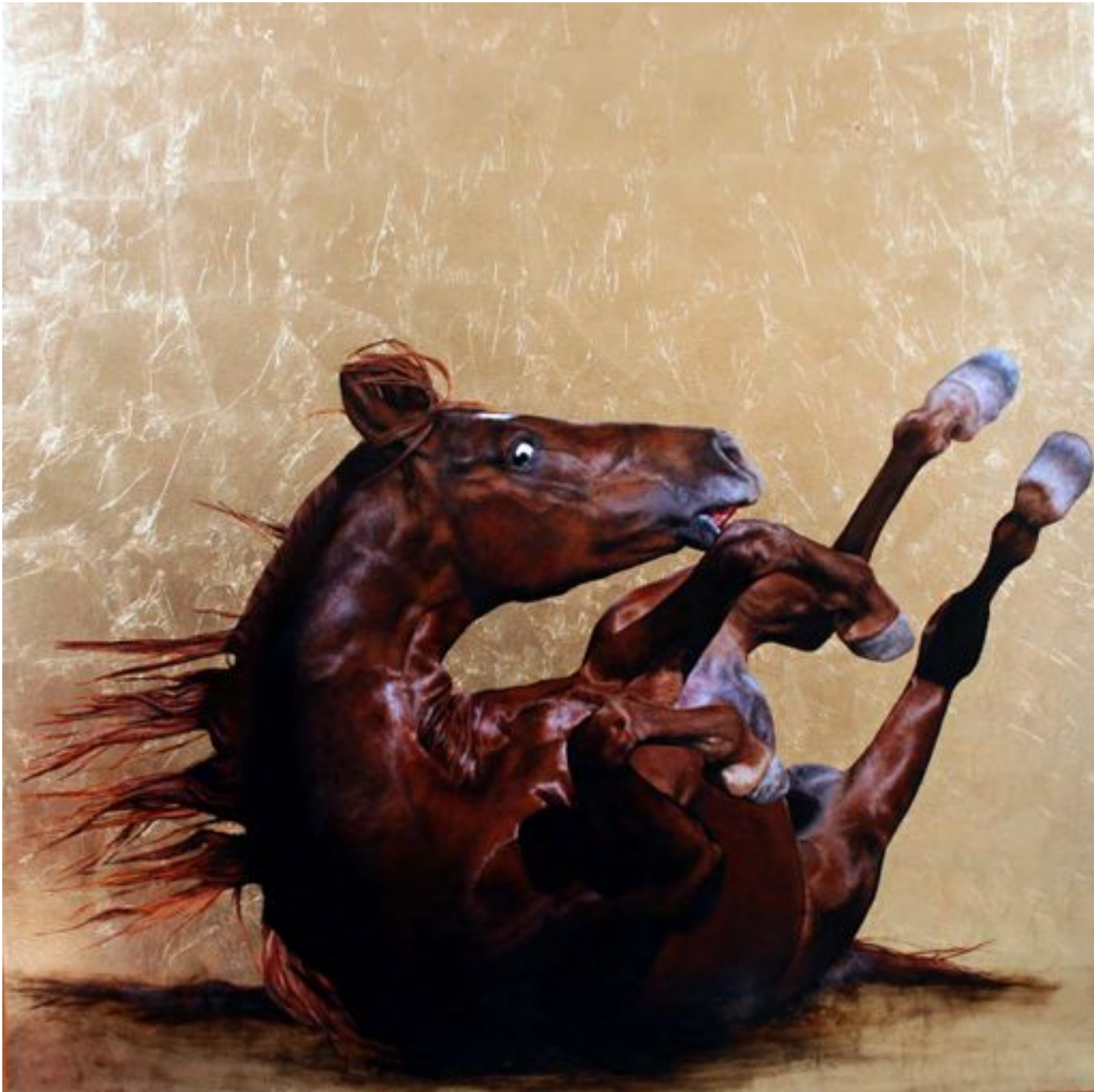
Leaving Eden: Vertigo oil and gold leaf on wood 48" x 48"